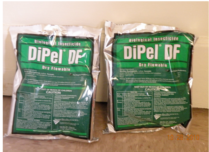
Figure 2. DiPel DF is a very popular OMRI-approved microbial insecticide containing Bacillus thuringiensis (Bt).

Few OMRI-approved insecticides are available for gardeners, and they could be hard to find in retail stores. These are typically the ready-to-use products that are priced high for small packages. Home garden pesticides that are not OMRI-approved may bear an “environment-friendly” mark on the package to indicate natural ingredients or low toxicity to nontarget species. Read the label carefully and decide your course of action. Gardeners have the option of purchasing OMRI-approved commercial organic insecticides online, because these are general-use products and do not require restricted-use permits to purchase. Small gardeners can buy products online from various websites including Arbico Organics, Grow Organic, BioControl Network, Gardensalive.com, and other vendors.